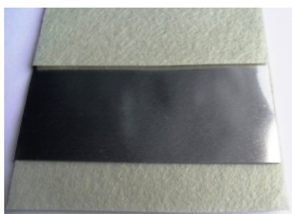
RadonProtect Foil with Wikaflor membrane

One layer of the protective membrane Wikaflor must be placed under and on the Radon Protect Foil in "sandwich" construction. Physical damage must be avoided. Please install the Radon Protect Foil shortly before implementing the floor screed. Construction work must not damage the Radon Protect Foil , no gaps, cracks, holes or leakages!