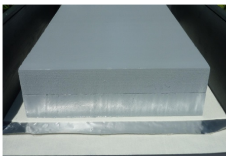
RadonProtect Foil System below the base plate