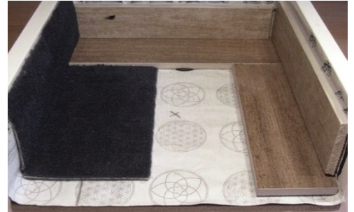
Feng Shui Mirror Foil VLIES/MESH below different floor coverings

Note: All actions must be cleared with the responsible architects and planners. The operating specialist company is exclusively responsible for the professional installation of Feng Shui Mirror Foil. Our information sheet is to advise you to the best of our knowledge. All included information is based on empirical values under normal conditions. This is not a legally binding warranty. Our application and processing guidelines are meant only to assist our customers when using our products.