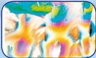
The same tap water after activation with the Shen-Ion Harmonik™ Aqua Vitaliser.

The more symmetrical crystalline structure and greater intensity of rainbow colors indicates higher vitality water.