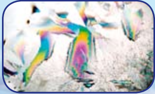
Municipal tap water.

Photographs of frozen water samples showing the energetic quality of water (according to G. Schoen)