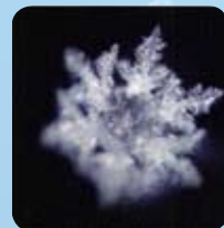
Same municipal tap water after activation.