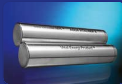
SHEN-ION HARMONIK™ Aqua-Vitaliser II