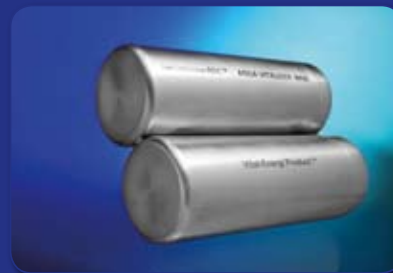
SHEN-ION HARMONIK™ Aqua-Vitaliser Maxi